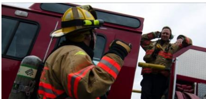
FASNY: Volunteer Firefighters OK'd for Tuition Aid in Erie County

The Fire Association of the State of New York (FASNY) sponsors the Higher Education Learning Plan (HELP), a tuition reimbursement program that helps student volunteer firefighters offset the cost of education at their local community college. Erie County and other areas of the state are putting these ideas and opportunities to work.